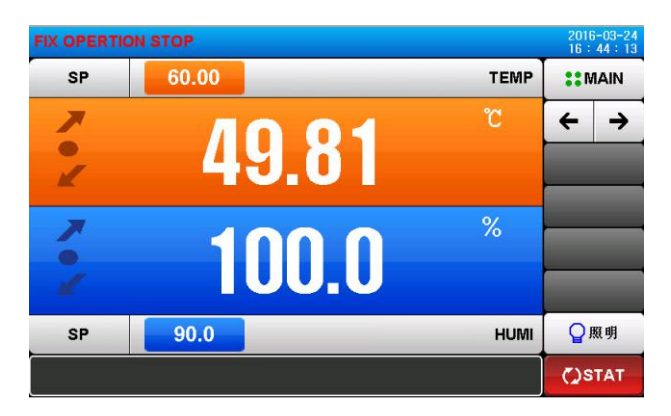
Temp. Humid. Programmable Controller